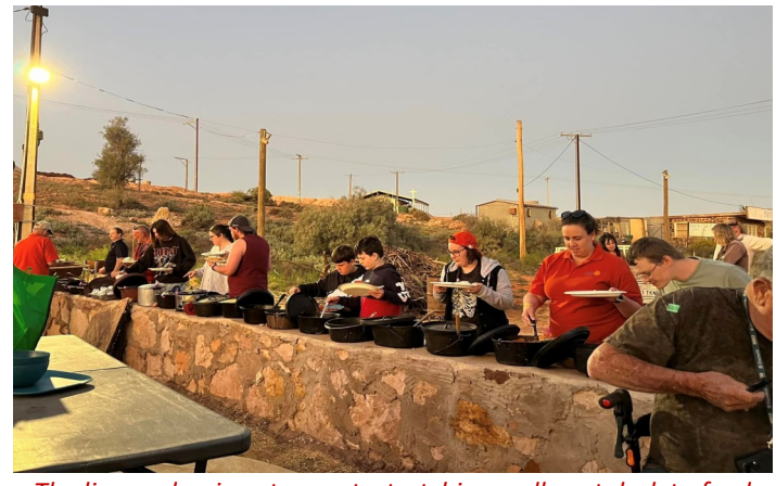
The line-up begins at sunset, stretching well past dark to feed 160 guests at the Camp Oven Cook-out event on 31st Aug.

CIRKIDZ IS BACK AGAIN FOR KIDS... In June 24 over 40 kids plus parents and carers participated in CIRKIDZ circus fun based activities at the Andamooka Recreation Centre and all are looking forward to the next event. A Kids & Family Fun Day incorporating the next CIRKIDZ workshop is being held on Saturday 14<sup>th</sup> September with activities starting from 1.30pm until around 4pm, assisted by APOMA Youth Officers and volunteers. Hotdogs and ice-blocks will be available to keep hungry kids happy, as well as a number of other games and activities for kids to enjoy. Kids and Families from Roxby Downs and Woomera, as well as visiting families are encouraged and very welcome to join in the day.