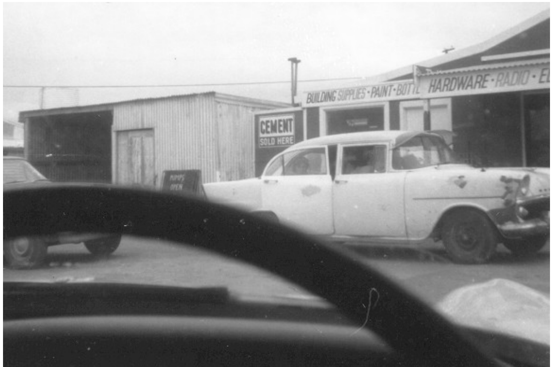
This months photo: This photo extracted from the historic files depicts someone driving into the old Andamooka Hub towards the general store was taken around the era that Dukes Guesthouse was established.

If this is improving the system.... then forgive us for not agreeing and for continuing to lobby for real care for our much loved and highly respected older citizens and for the others of us in need of assistance.