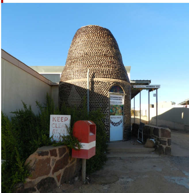
The iconic Bottlehouse stands today as a welcoming sentinel at the entrance to the facility.

Bucket showers (tread up your own water), hard water, generators off at 11pm, hot nights, cold nights, flies & dust, kerosene fridges that didn't always keep the beer cold, were all part and parcel of that wealth of wonderment that is the lure of the Outback. And if the rain kept you here but the food supplies out, well all the better!! The hospitality shown by the unique array of local identities would always keep one bemused.